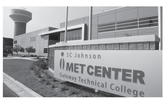
SC Johnson iMET Center 2320 Renaissance Blvd. Sturtevant, WI 53177