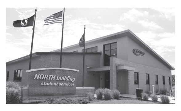
Elkhorn Campus 400 County Road H Elkhorn, WI 53121