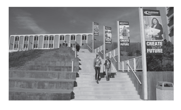
Racine Campus 1001 S. Main Street Racine, WI 53403