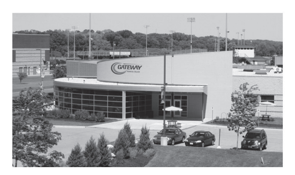
Burlington Center 496 McCanna Parkway Burlington, WI 53105

Administration Center • 3520 - 30th Avenue • Kenosha, WI 53144