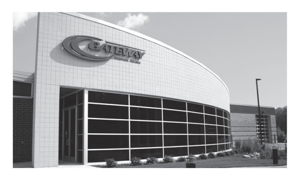
HERO Center 380 McCanna Parkway Burlington, WI 53105