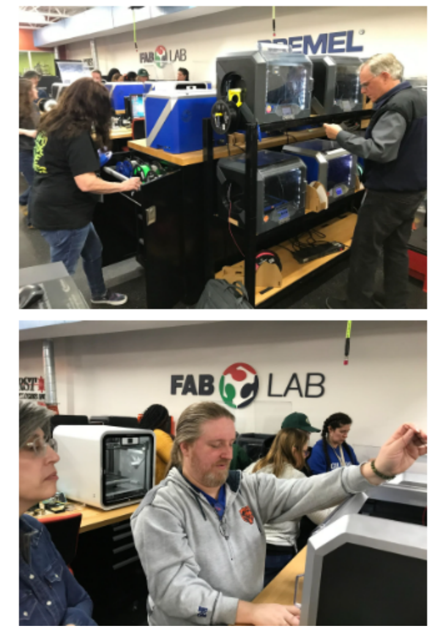
Fab Lab 10:00 AM Radio Show

Racine Unified Librarians came for 3D printer training. The School district, in an initiative to integrate more STEM concepts into curriculum, is expanding the capabilities of its libraries. Twelve instructors stopped to learn about setting up their printers, slicing models and loading filament. Gateway Industrial design Fab Lab also talked about the evolving nature of the educational environment and how Gateway can help. As we work to change the nature of education, we look forward to conducting training on all Fab Lab equipment to help librarians more capable of assisting instructors.